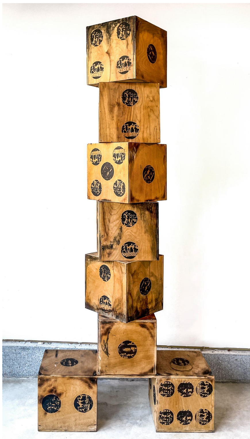
Playing with Fate, Silkscreen on Wood 109" x 21" x 19"