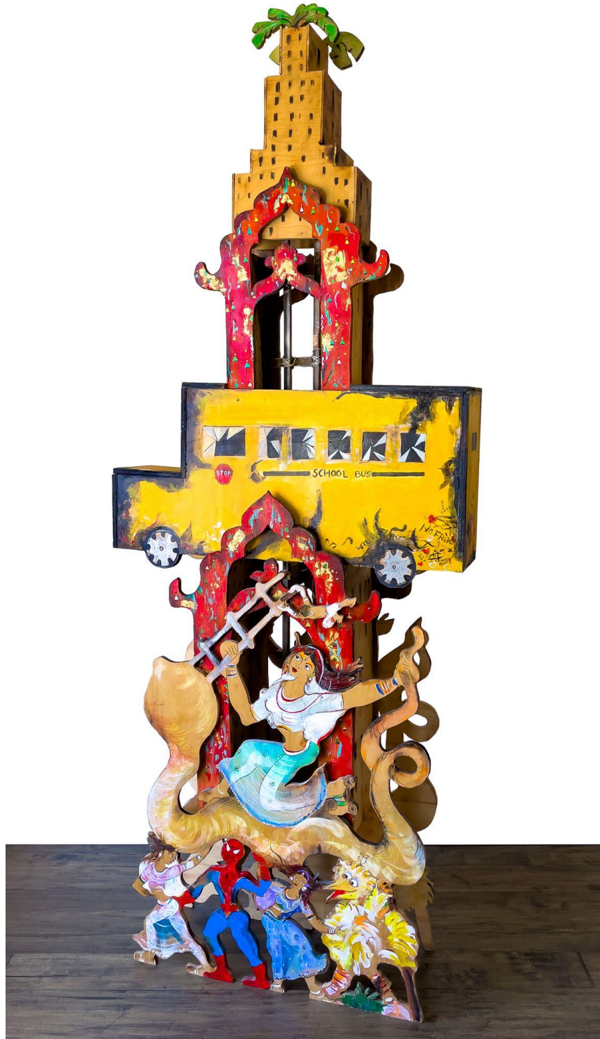
Power of Myth, Mix media and Paint on Burnt Wood, 84" x 32" x 10"